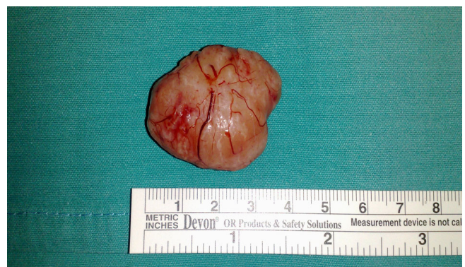
Figure 1. The mass (schwannoma) is seen after removal.

Neurologic deficits are very rare during the diagnosis. The possibility of the occurrence of the compression symptoms, pain and neurological deficits increases as the mass grows. Neurological deficits including the lower cranial nerve palsies, dysphagia, voice changes, Horner's syndrome and arm paralysis can be observed.